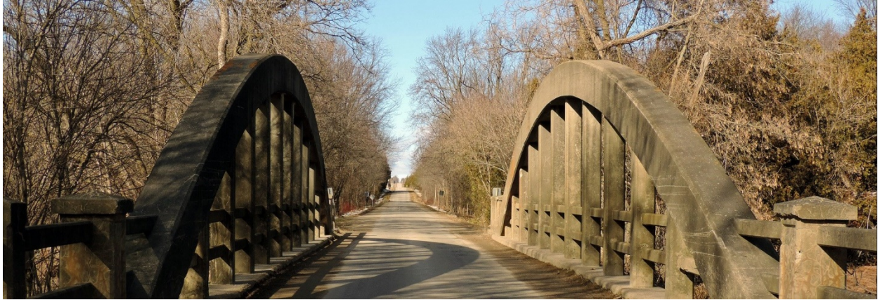
Adjala-Tosorontio: Where Community Meets Nature

To see full strategic plan, click here .